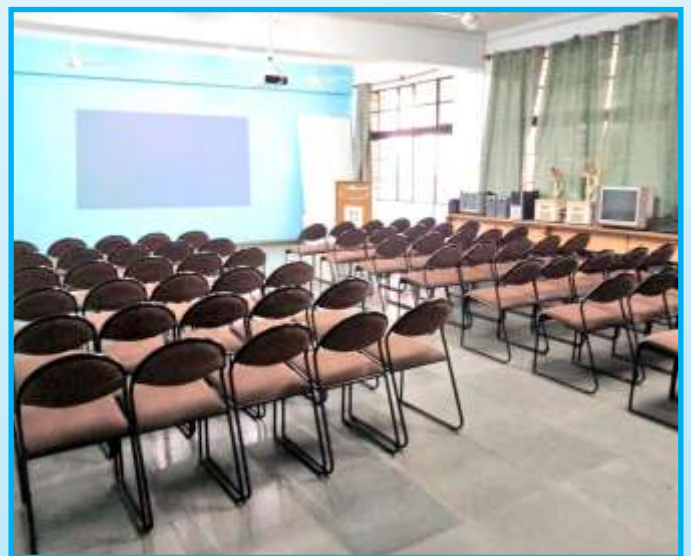
Educational Technology Lab