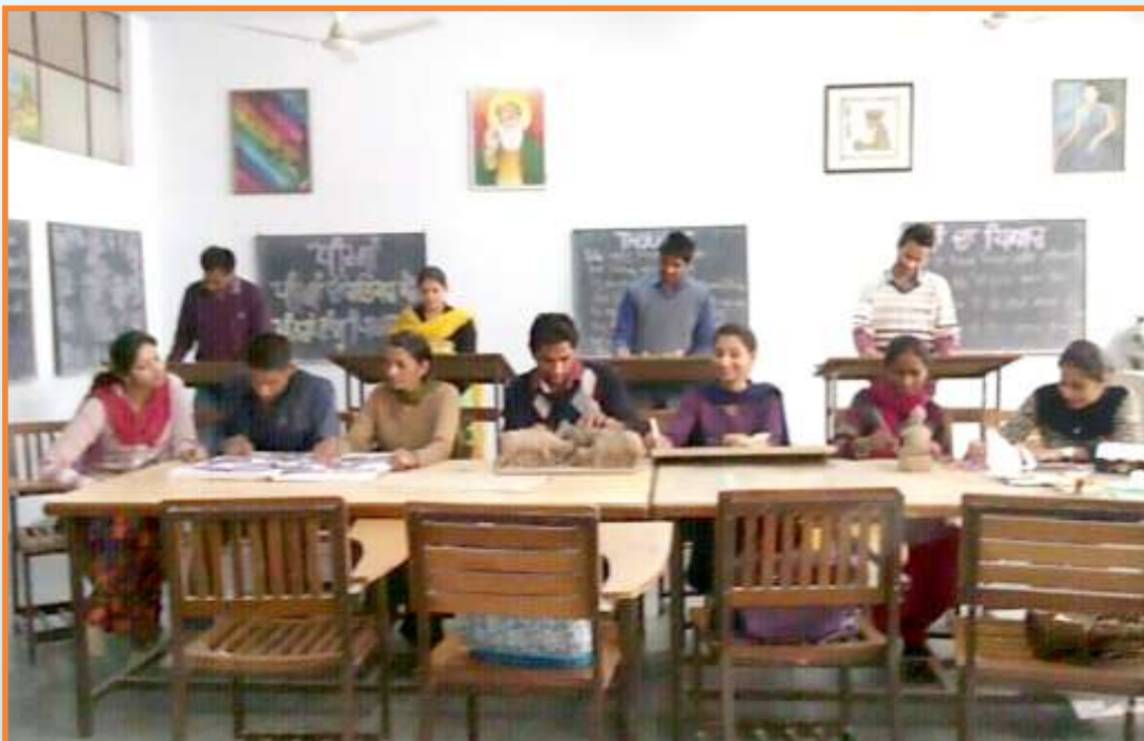
Fine Arts Room