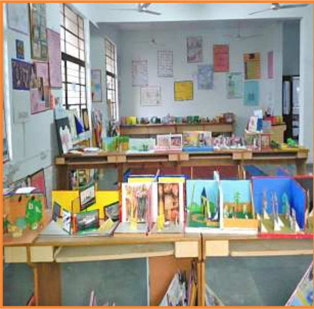
Teaching Aids Workshop